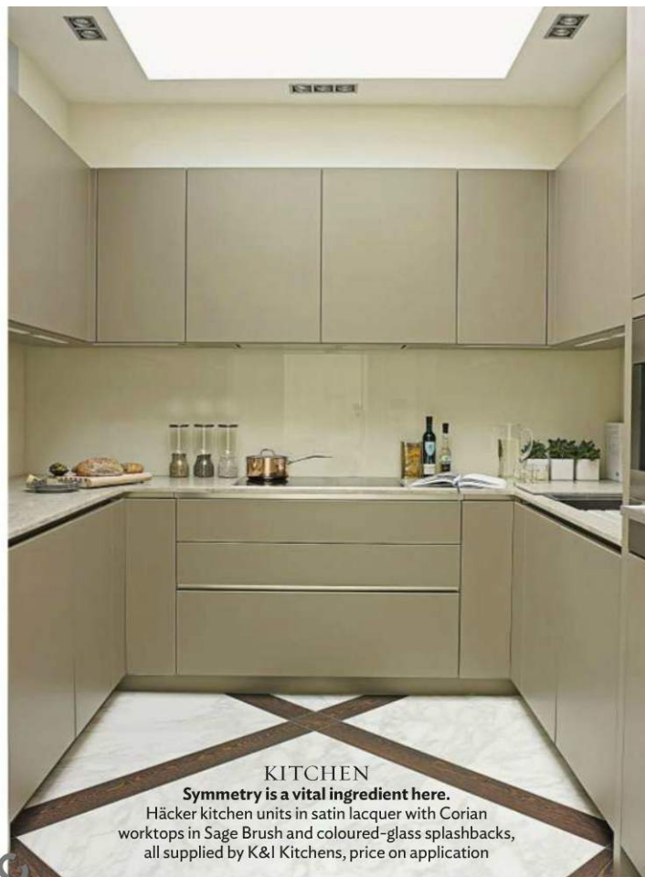
KITCHEN Symmetry is a vital ingredient here. Häcker kitchen units in satin lacquer with Corian worktops in Sage Brush and coloured-glass splashbacks, all supplied by K&I Kitchens, price on application