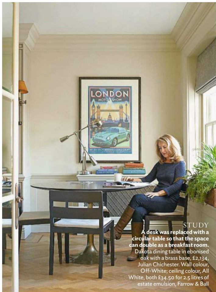
STUDY A desk was replaced with a circular table so that the space can double as a breakfast room. Dakota dining table in ebonised oak with a brass base, £2,134, Julian Chichester. Wall colour, Off-White; ceiling colour, All White, both £34.50 for 2.5 litres of estate emulsion, Farrow & Ball